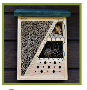
🔵 Bee hotel