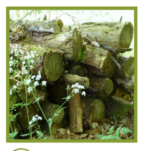
) Log pile or dead hedge